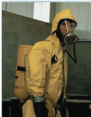
A supplied-air respirator

Further assistance on general respiratory protection in the workplace and respiratory protection resources specifically for health care providers, emergency responders, construction workers, firefighters, etc., may be obtained from the organizations listed below.