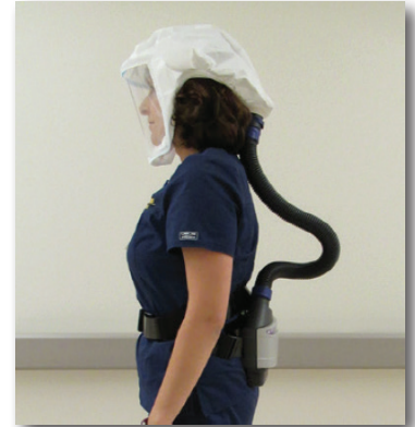
A powered air-purifying respirator